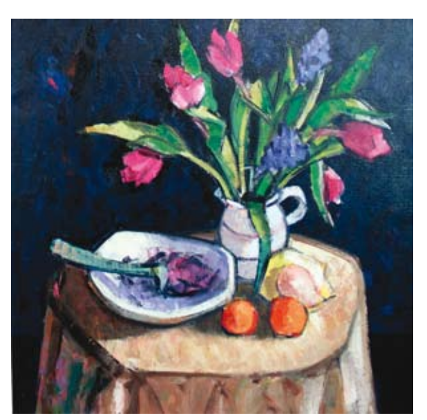
Artichoke with Tulips, oil on linen, 61 x 61 cms

Please contact Ruth Lock for more information or high resolution images