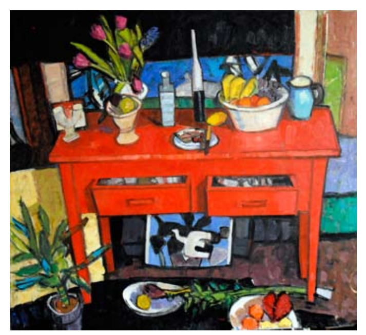
Studio Situation, oil on linen, 101.5 x 112 cms

Archie Forrest is a perfectionist and is uncompromising in the high standards he sets himself. He works in the Glasgow School/Scottish Colourist tradition with still life, figure and landscape subjects (often France or Italy) of brilliant colour and bravura handling underpinned by fine drawing and sense of form; he is also a sculptor of considerable merit. His paintings are highly sought after and appear in many private and public art collections, including The Duchess of York, BBC, Glasgow Art Club, Ian Jay Associates, One Devonshire Gardens, Royal College of Physicians, Scottish Amicable, National Portrait Gallery and the Scottish Opera.