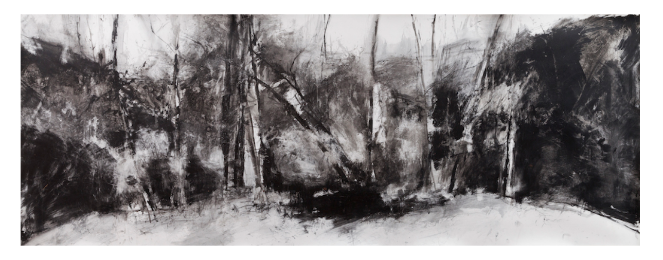
Dominique Cameron – Falling Tree – Mixed Media on Paper – 140 x 60cm