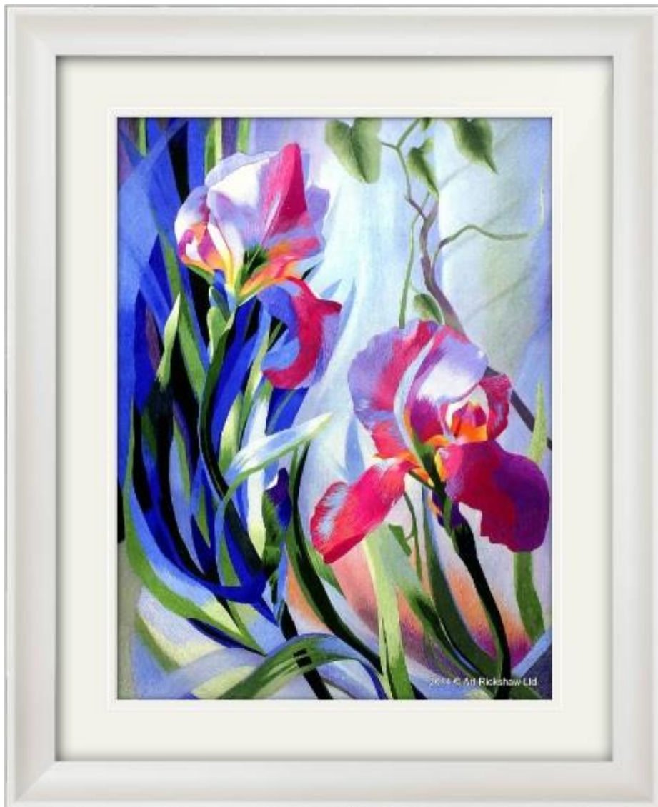
Sea of Flowers, Pure Silk

Daily Mon – Sun 10am – 7pm (appointments can be made outside these hours)