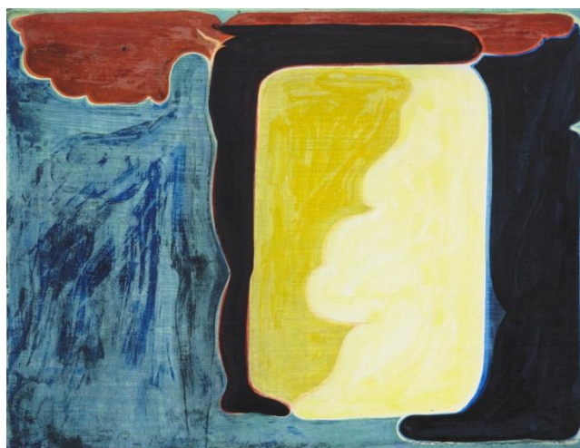
Capital (Closed) (2012) watercolour on panel