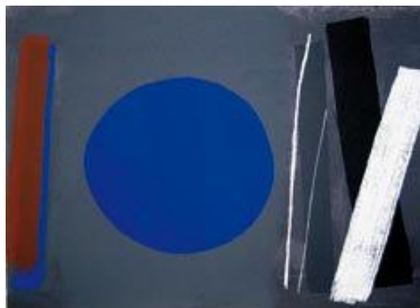
Quiet Time (1999) screen print

In this exhibition we are pleased to present some of the prints created at the Curwen Studio and a group of prints made at the Graal Studio.