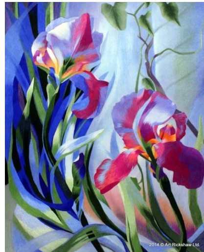
Sea of Flowers, Pure Silk 52.5 x 39.5 cm