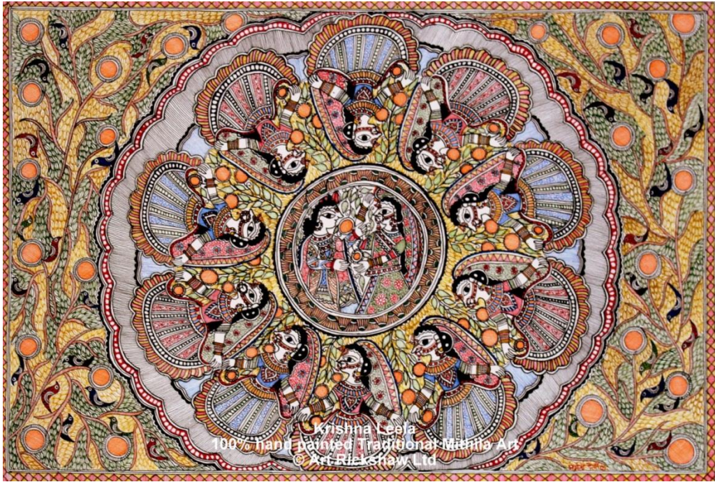
Krishna Leela, Indian Dance Acrylic on hand made paper 22 x 30 in

Revive! An Exhibition by Art Rickshaw is a rare opportunity to see an independent collection of 100% handmade silk embroideries, hand painted Madhubani and Tibetan Art.