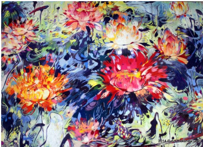
Abstract Flowers, Pure Silk 60 x 48 cm