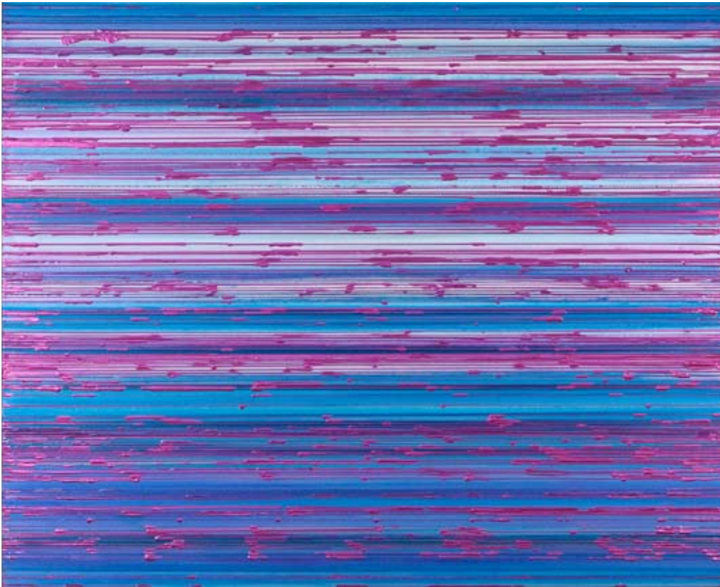
Colin McCallum Interference - Purple Blue acrylic on canvas H 810 x W 1000 mm 2008

In his interpretation he presents us with a hypnotic grid of ripples or waves of light in a uniform balance, symmetrical to the edges, the symbol of an ideal that never exists.