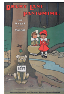
John Hassall (1868-1948) Printed poster, £900 The Rae-Smith Gallery