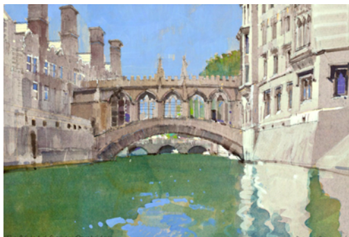
David Sawyer (b. 1961) Watercolour, £750 Thompson's Galleries