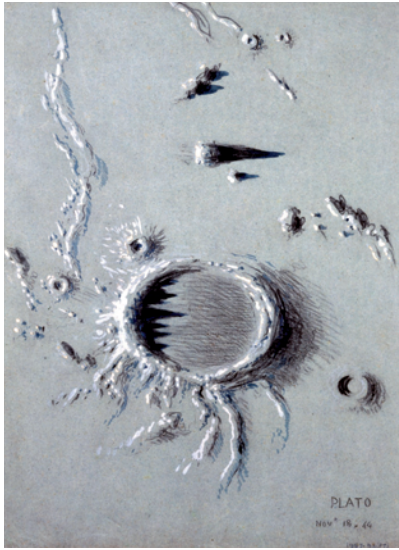
James Nasmyth (1808 - 1890) Sketch of Lunar Crater Plato 1844