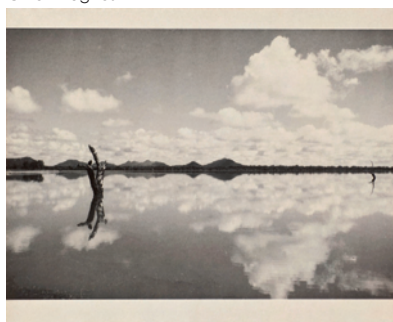
Lionel Wendt (1900-1944) Gelatin Silver Print, £2,000 ASAL Partners