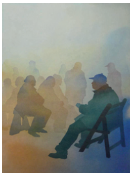
Ali Yanya (b. 1963) Watercolour, £800 ORME 11