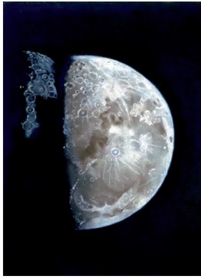
John Russell, RA The Telescopic Study of the Moon 1796