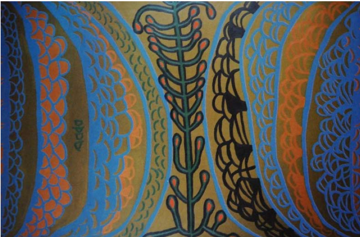
Dada - Coex'ae Qgam Basarwa Food oil on canvas 1500 x 1000 mm 1992

Bicha Gallery 7 Gabriel's Wharf South Bank London SE1 9PP