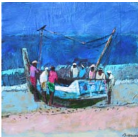
Pushing the Boat Out mixed media, 25.5 x 25.5 cms