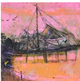
Crows and Nets mixed media, 25.5 x 25.5 cms