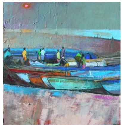
Dusk over the Arabian Sea mixed media, 81 x 76 cms