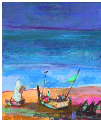
Discussing the Catch mixed media on board, 147 x 122 cms