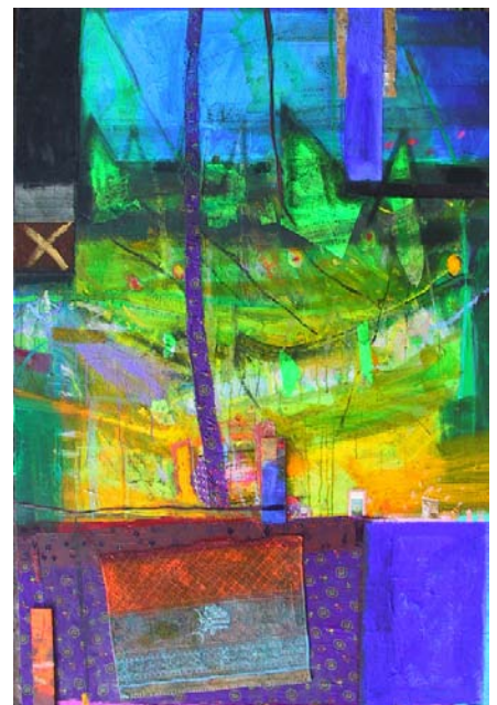
Indian Decorations mixed media on board, 167 x 112 cms

Contact Robin McClure for more details 16 Dundas Street, Edinburgh EH3 6HZ tel. 0131 558 1200 mail@scottish-gallery.co.uk www.scottish-gallery.co.uk