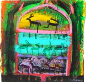
Animal Oil Lamp Screen II mixed media, 25.5 x 25.5 cms