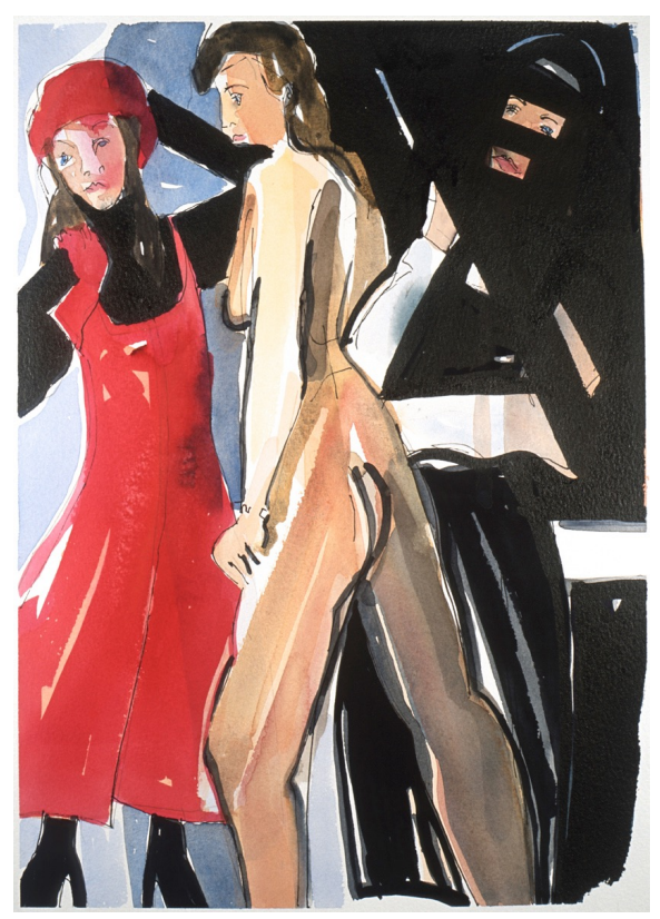
'Some Like It Hot' Textile on canvas 152 x 122 cm