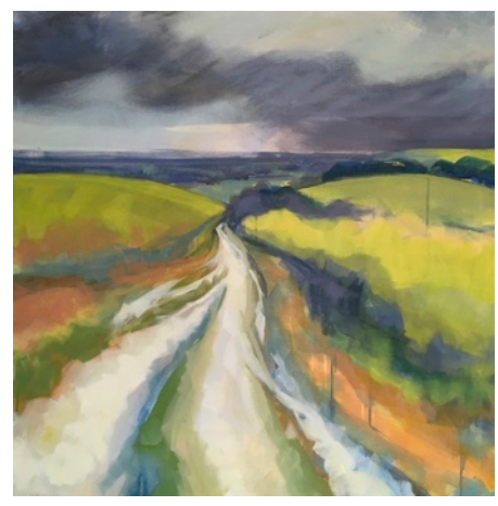
Walking the Chalk, Downhill Stretch, 2017, acrylic on canvas, 90 × 90cm