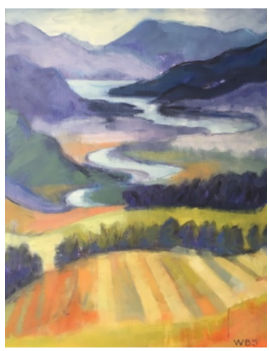
Looking Back to Queenstown, 2016, oil on canvas, 91 x 71cm