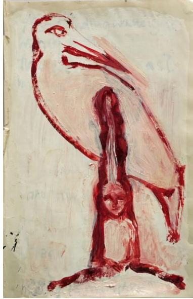
Bird making womb for my consciousness. Oil on paper.