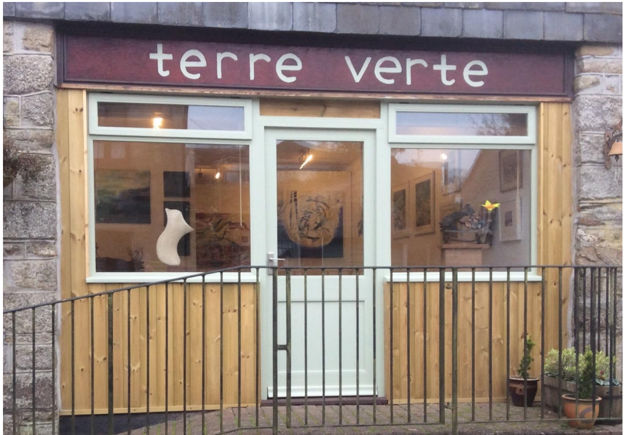
The gallery in Altarnun.