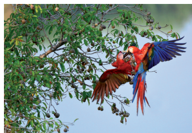
Macaws