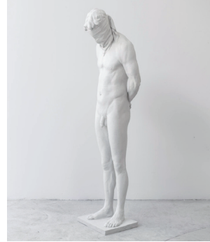
Untitled Marcos Perez