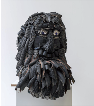
Re 'Cycle'd Tyred Head Buffy