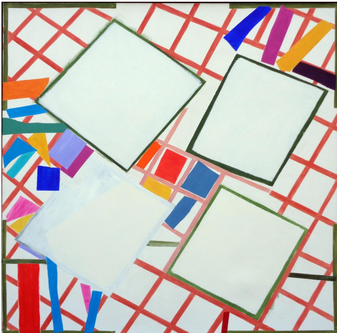
Sandra Blow's majestic 6ft sq. 'Groundplan' Acrylic and collage on canvas

Bohun Gallery's September show will be a great opportunity for collectors of 20 th Century British Art to see some of the very finest examples of Sandra Blow's original paintings and collages gathered together under one roof, including two of her celebrated 'six-footers'.