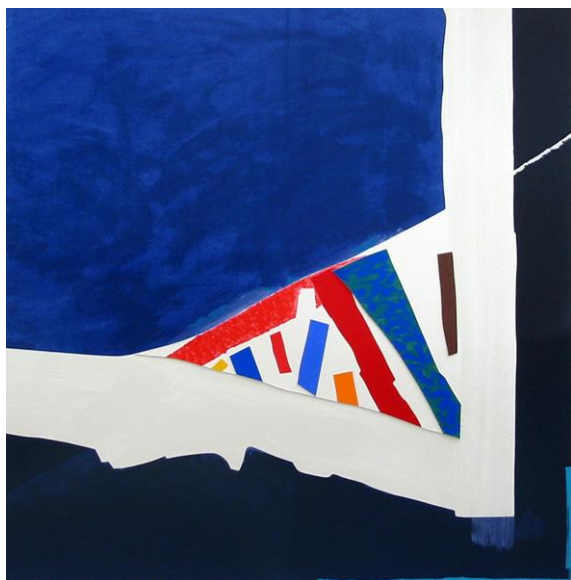
'Brilliant Corner III' Silkscreen 25 x 25ins

The show will also include smaller collages which illustrate her use of easily manipulated collage materials, like torn paper and sack cloth and brightly coloured canvas cut-outs, which cover her picture space. The Matisse-inspired decorative manner of her later career is well represented in colourful works such as 'Blue Abstract' and 'Red Squares'.