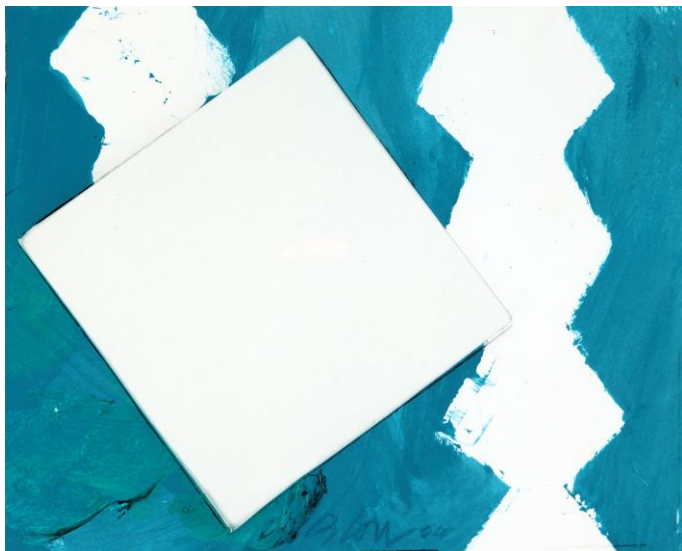
'Blue Abstract' Gouache & collage on paper 21 x 26ins