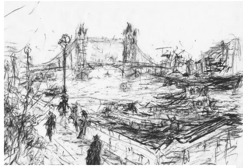
View from Old Billingsgate

The American Artist, Jim Dine described drawing as ‘... talking as clearly as I can’. For me drawing is a language at its most direct when I am drawing from life. The subject of my latest Exhibition is ‘Life in the City’. A visual expression of my experience of London. I hope to convey its movement, drama, structures, overheard conversation, fleeting glimpses, changing weather and not forgetting, the ebb and flow of the mighty Thames.