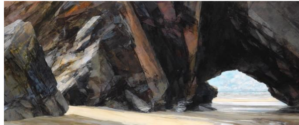
'Sunlight at Diggory's', oil on linen, 60 x 140 cm

Adams is well-known for capturing the scale and romance of sea caves and natural arches, but this will be the first time she has presented a collection of works with colour as the cohesive theme.