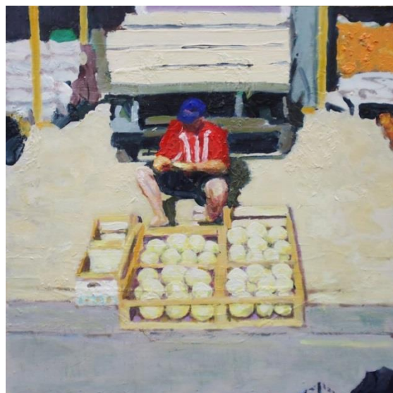
Man selling melons, San Juan, Argentina. Oil on board. 60 x 60cm