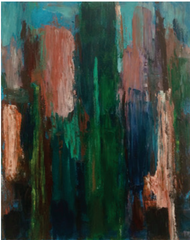
(above) 'Hudson' 2015 acrylic on paper, 10 x 15 cm