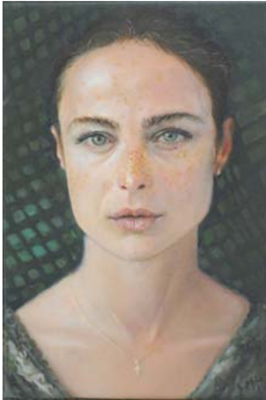
Yanko Tihov, Face , oil on linen.

Private View Wednesday 2 nd September 6-8pm