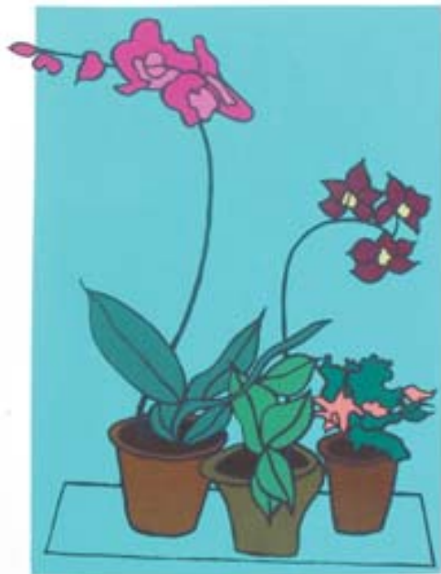
Turquoise Orchid , screenprint, edition of 3, 51 x 34cm

He studied at Camberwell College of Arts and spent several years as a keyholder at East London Printmakers in Hackney. During 2005 he was a resident artist at the Florence Trust, Islington. He now shares his time between Suffolk and London.