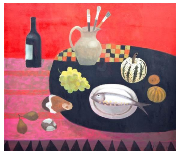
Three Brushes, 2006 Oil on canvas 32x35ins

15 Reading Road, Henley-on-Thames, Oxfordshire RG9 1AB