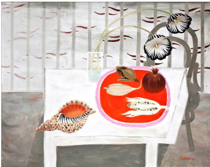
The Shell, 2000 Oil on canvas 40x50ins.