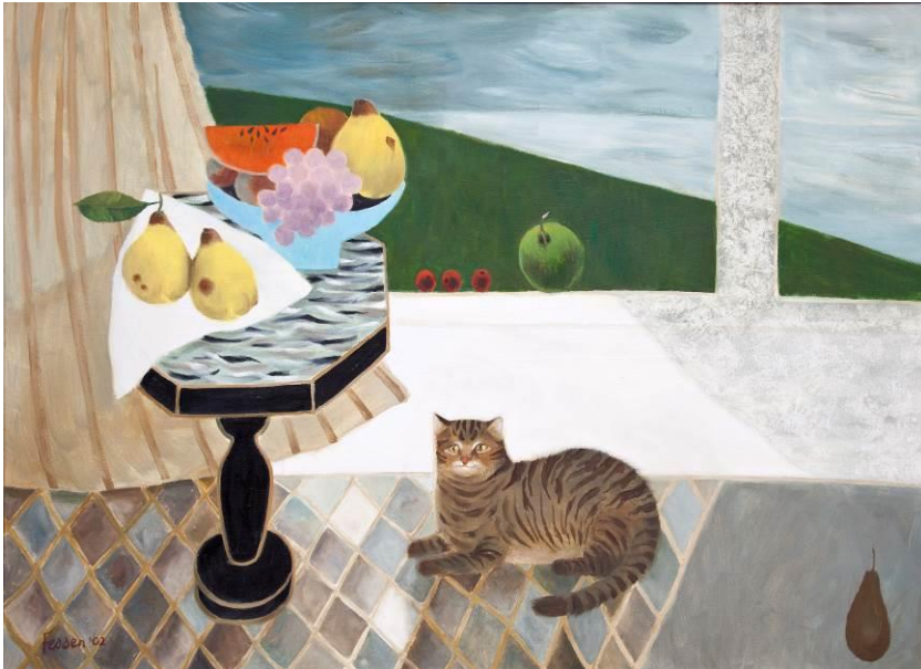
'Tabby by a Marble Table' 2002 Oil on canvas 36x50ins.