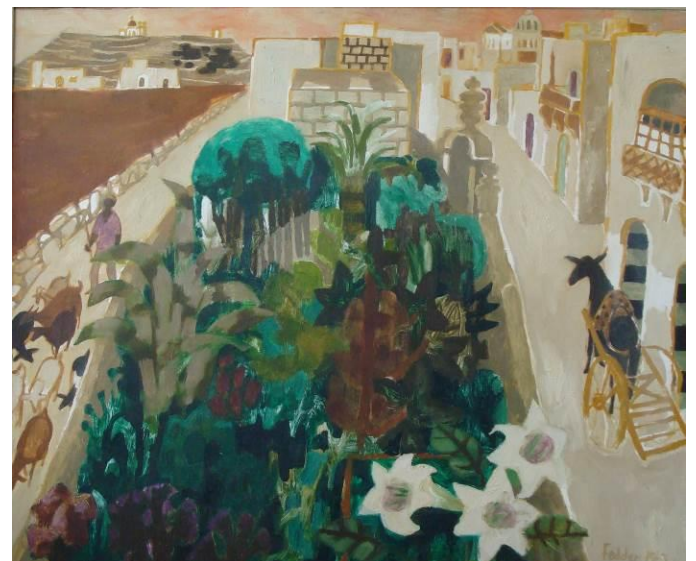
Garden at Gozo, 1963 Oil on canvas 30x36ins.