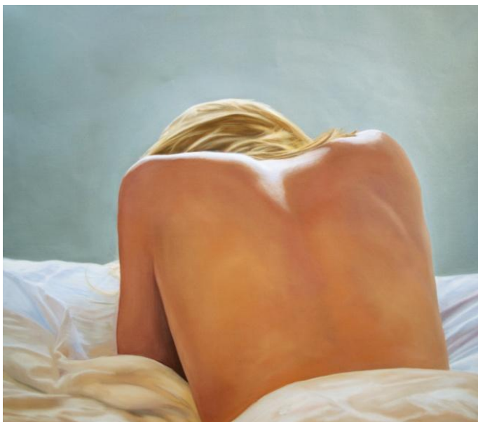
10:00 AM (oil on canvas)-30x34 inches-2015

For her fifth solo exhibition, and first in London, “The Innocents”, the painter Laurel Holloman takes us on an emotional journey and an exploration of how life changes us, as we age.