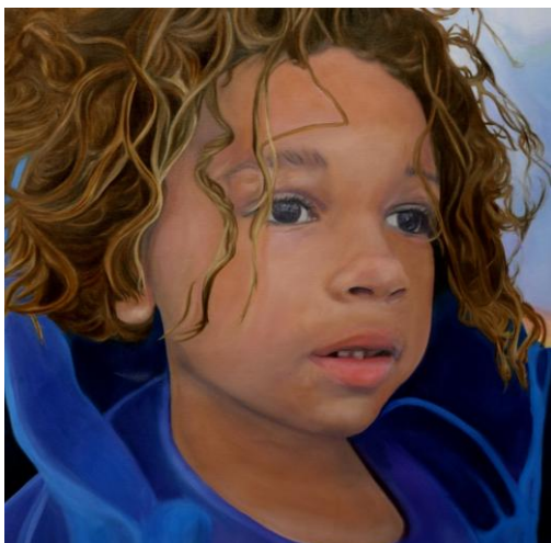
The Sunset (oil on canvas)-20x24 inches-2015

I found that, with my oldest subject who was in her late 80's, there was a sense of awe at the world and it was reflected in her eyes and the energy of her spirit, much like the spirit of a child.