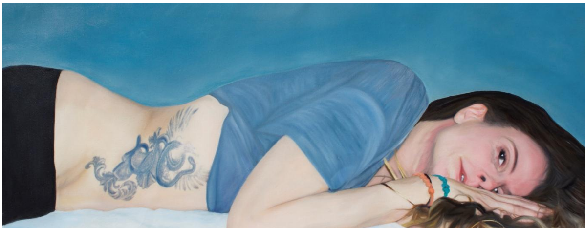
The Warrior (oil on canvas)-24x42 inches-2015