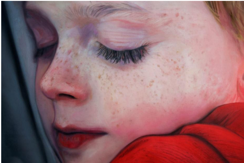
Brother Love (oil on canvas)- 20x30 inches-2015

Online catalog available from www.laurelholloman.net