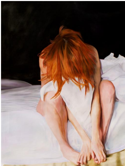
The Undecided (oil on canvas)-48x36 inches-2015

"My goal is to photograph, then paint, early childhood and innocence, i.e, life without the heartbreak to the challenges of adulthood, and then contrast it with more mature portraits. I have worked with models, all women, and I asked them to share something painful, before the shoot. Something to do with grief. I was curious as to how difficult events change us when we grow older. For example, a 24-year-old's portrait may have an air of discovery or curiosity or even defiance, while a 47-year-old's, after a break-up, may have more heaviness and sadness.