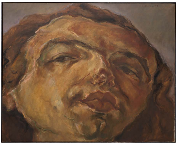
Untitled , oil on canvas, 156cm x 195cm, 1973

The Mosaic Rooms, 226 Cromwell Road, London SW5 0SW