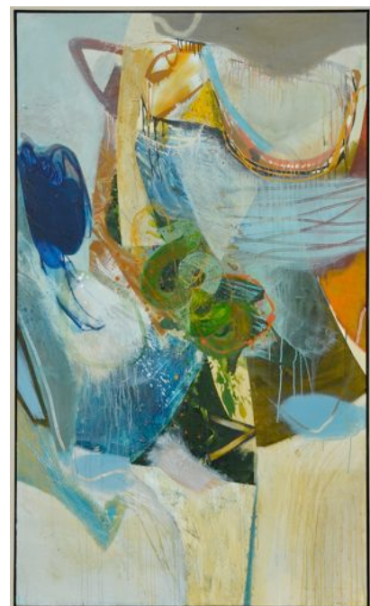
Left to Right: Suspended Lines 2014, Acrylic on Canvas laid to wood panel, 92cm x 92cm (Price: £9,500) & Propriété Privée 2014, Acrylic on canvas, 200cm x 118cm (Price: £18,000)