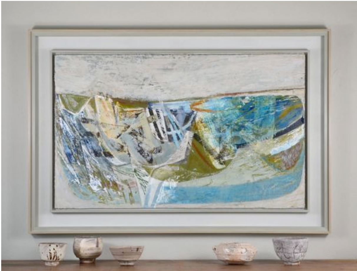
Flooded Pools, 2014, Acrylic and collage on wood panel, 64cm x 104cm (Price: £8,500)

The extraordinary marsh landscape of Western France and its rare salt pans is coming to London, in the form of paintings by highly regarded abstract painter, Peter Joyce.