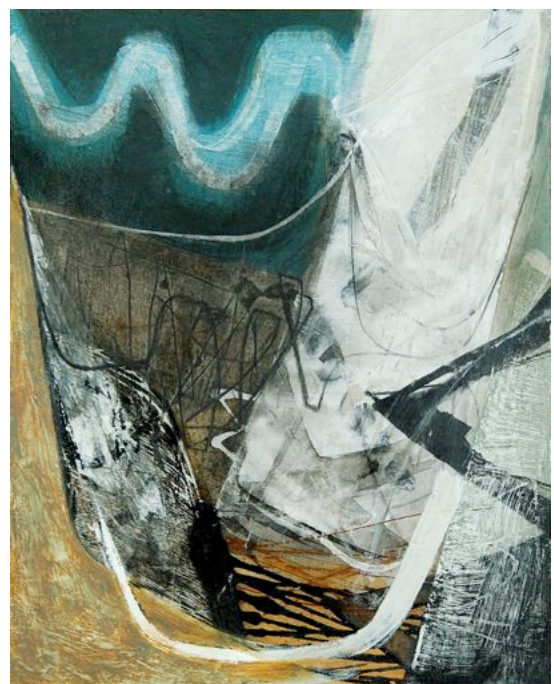
After the Lock Gates, 2014, Acrylic on paper, 38cm x 30cm (Price: £2,500)

Of the Marais Breton Vendeen, he says: “I love being here, it’s a challenging landscape reclaimed from the sea.