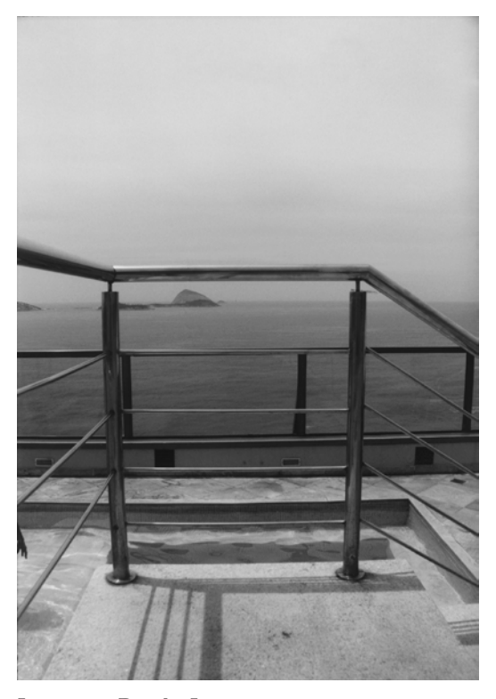
Ipanema. Rio de Janeiro