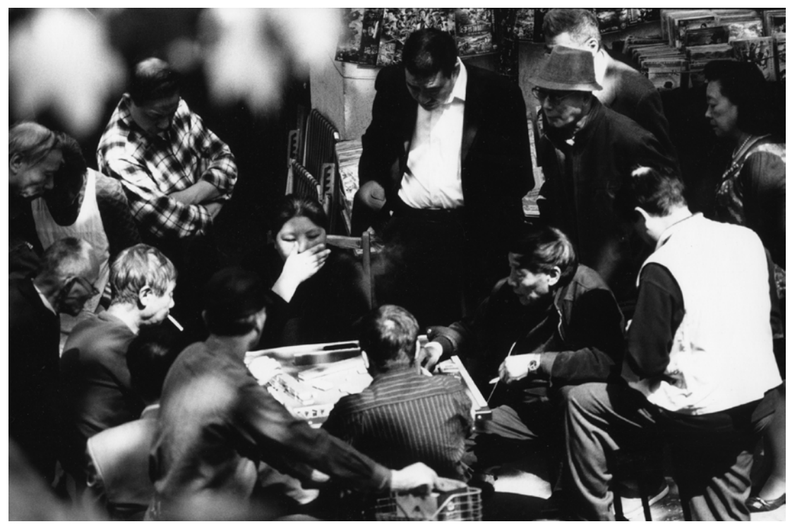
Street life on Xiang Yang lu

\frac{Social}{\text{\#TravellingBW}} christophedolhem.com