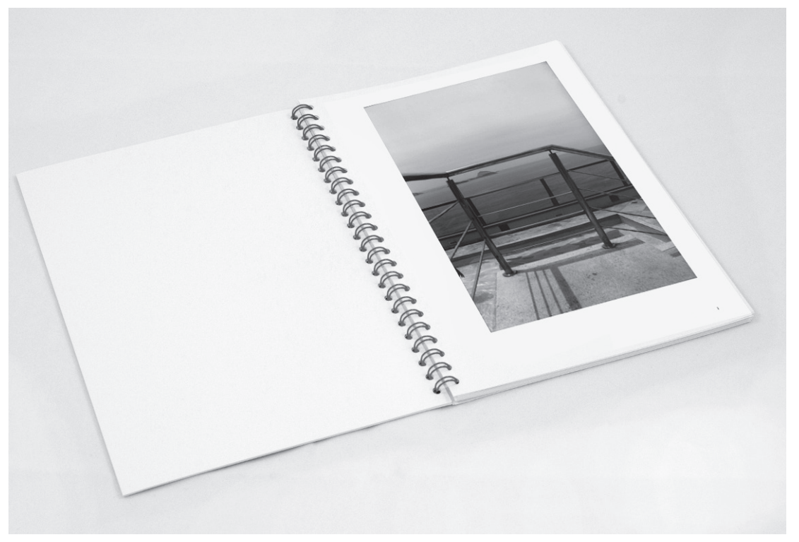
Exhibition Book for sale at the exhibition