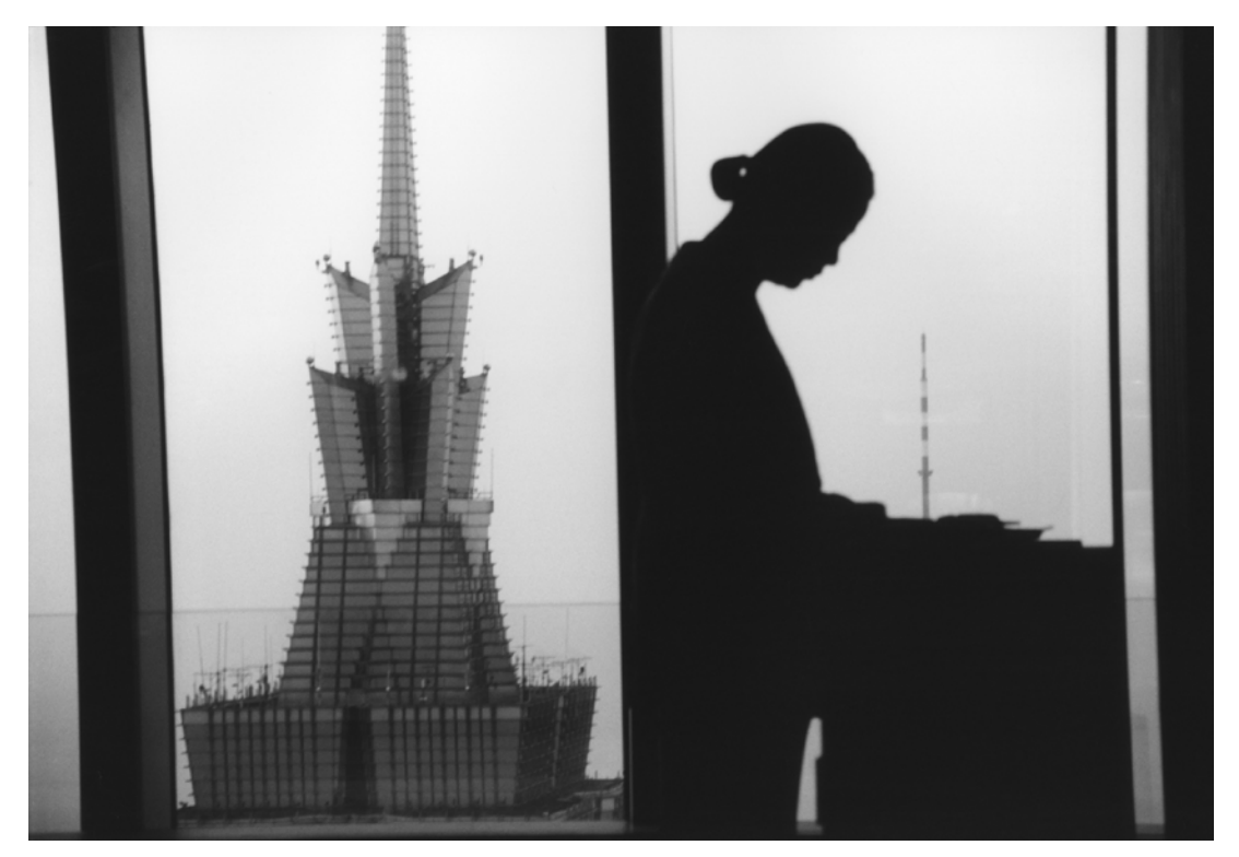
First day. Shanghai. Pudong

Social #TravellingBW christophedolhem.com