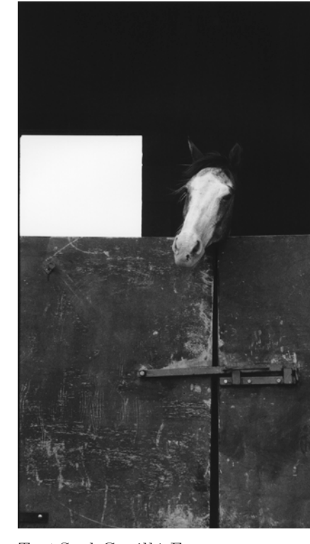
Tout Seul. Genillé. France