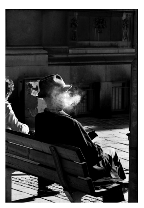
Vår i Stockholm