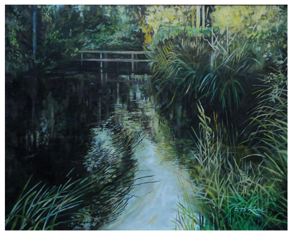
Ouderdyk (Texel, Netherlands) 80 x 100 cms, Oil on Canvas