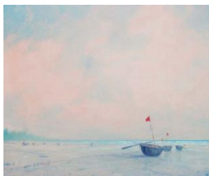
Fishing Coracles at Hoi An, Vietnam