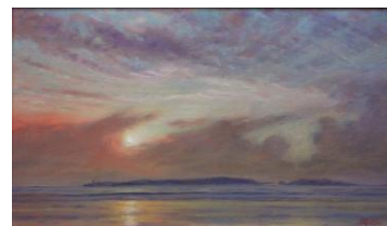
Sunset at Essuoiera