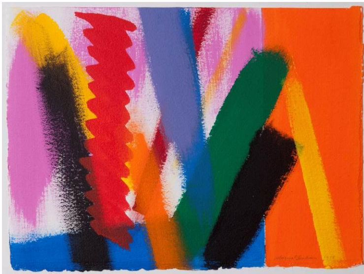
Wilhelmina Barns-Graham 'Untitled 37/98/A'