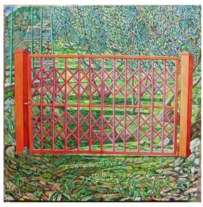
Leonardo's Red Gate, 120 x 120cm, Oil on linen, 2012/13