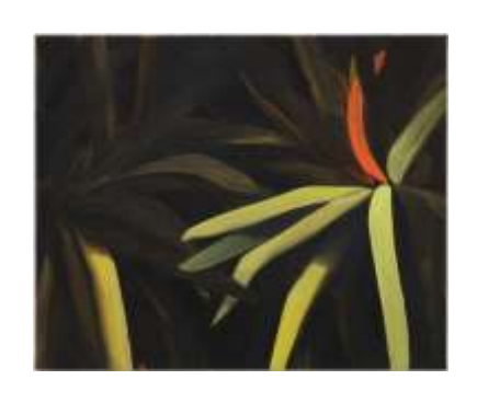
CHLOE STEELE 'Red Sting' Oil on linen