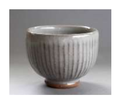
MATT WAITE Glazed Cornish stoneware bowl