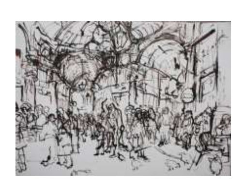
PIPPA RIDLEY 'Leadenhall Market' Ink on paper