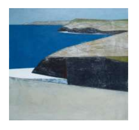
VANESSA GARDINER 'Cliff Wall (Pentargon)' Acrylic on board