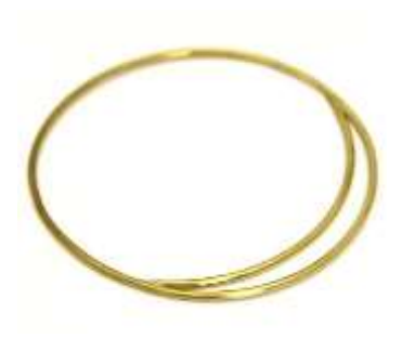
RHIANNON LEWIS Gold plated silver bangle with interior curve

High resolution and additional images available on request.