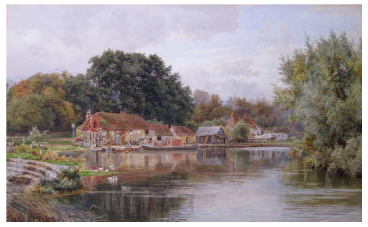
WILLIAM BRADLEY (fl. 1872 – 1889) "The Swan Inn & Weir Pangbourne". Watercolour. 15" x 25" (381 x 635mm). Signed