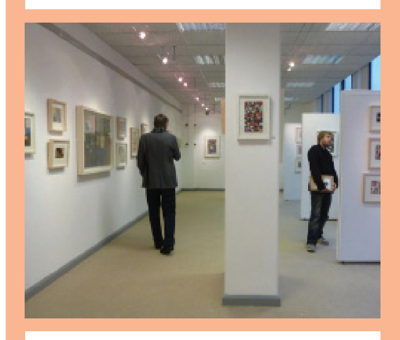
Lewis Elton Gallery