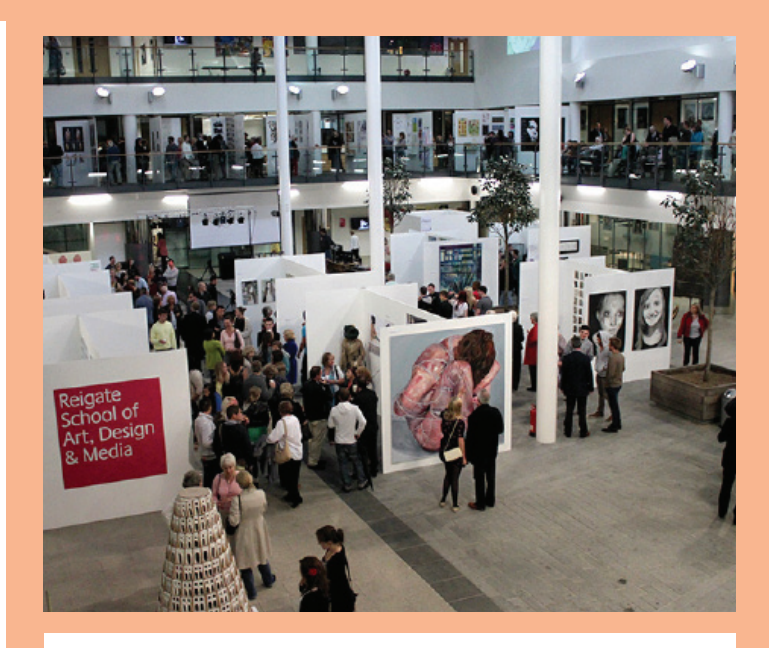
East Surrey College

A spacious light space above a lovely cafe, this new idyllic gallery situated in the hart of Surrey, with easy access on the A25 or train from Guildford. Accommodates work from 19th and 20th Century printmakers and glass exhibited alongside local visual arts and craft.