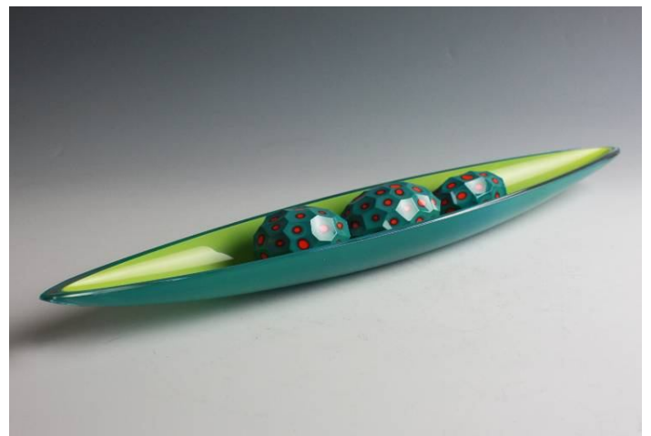
Rachel Woodman, Green Canoe with 3 faceted pebbles £4400

Bruno Romanelli uses 'the principles of form, colour and light in a quest to achieve the perfect combination of these three fundamental elements'.