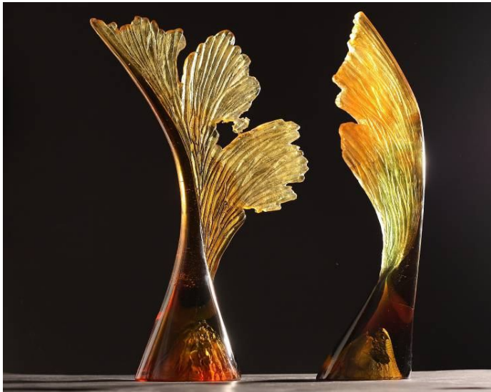
Crispian Heath, Seeds with Wings £POA