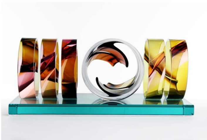
Phil Vickery, Distracted Thoughts £3600