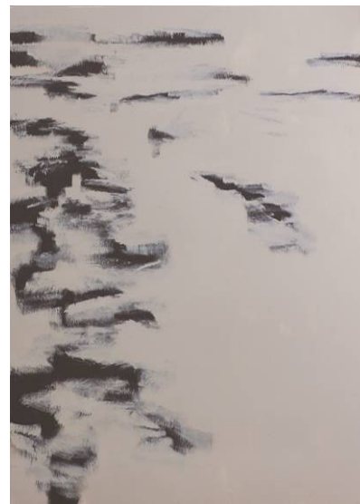
shallow sea, acrylic on canvas