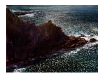
Title: Sheer cliff headland Description: Oil on canvas Size: 555x740mm

Title: Capnagower from kinnacorra Description: Water colour Size: 42x56cm