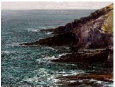
Title: East cliffs Description: oil on canvas Size: 555x740mm

Title: Lazybeds and the green road, Clare Island Description: Mixed media Size: 56.5x76cm