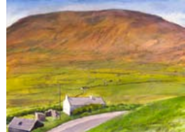
Title: Hannahs house and Croaghmore Description: Mixed media Size: 560x775mm

gallery@thewebbsgallery.co.uk 1 Burland Rd, Battersea London SW11 6SA t. 0207 223 1733 f. 0207 223 1738 Opening hours Mon - Fri 9.30 - 17.30 Sat 10.00 - 18.00 Sun 10.30 - 16.30