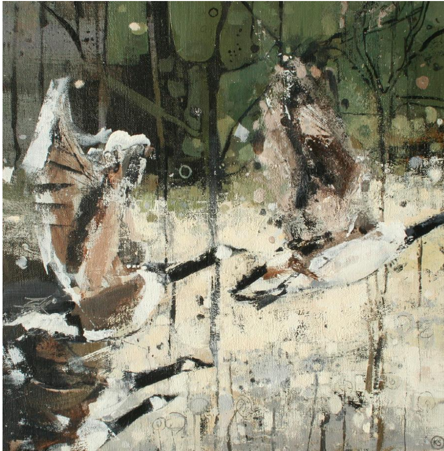
Katy Spong: Taking Flight , acrylic on canvas