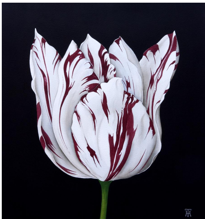
Tobias Hodson: Semper Augustus Tulip , watercolour

RhueArt was first set up in 2003. In 2008/9 it became a Highlands and Islands Enterprise account-managed business and, with that, has increased the number of artists it works with.