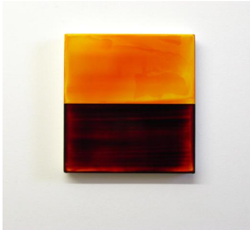
James Lumsden: Liquid Light (study 4/08) , acrylic on canvas