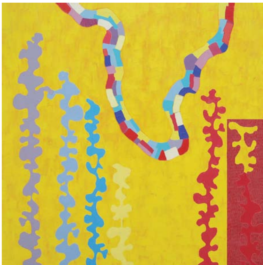
John Crossley Southern Call H 700 x W 700 mm oil on paper on board 2010

Opening Reception: Thursday 14 April, 2011 | 6.30 to 8.30pm