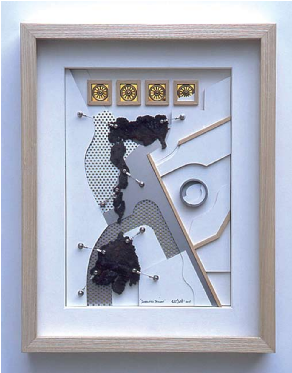
Philip Booth, Interrupted Descent , Illustration board, wood, aluminum, acrylic & oil, 2005

T +44 (0)7721 400 048 E info@bicha.co.uk www.bicha.co.uk