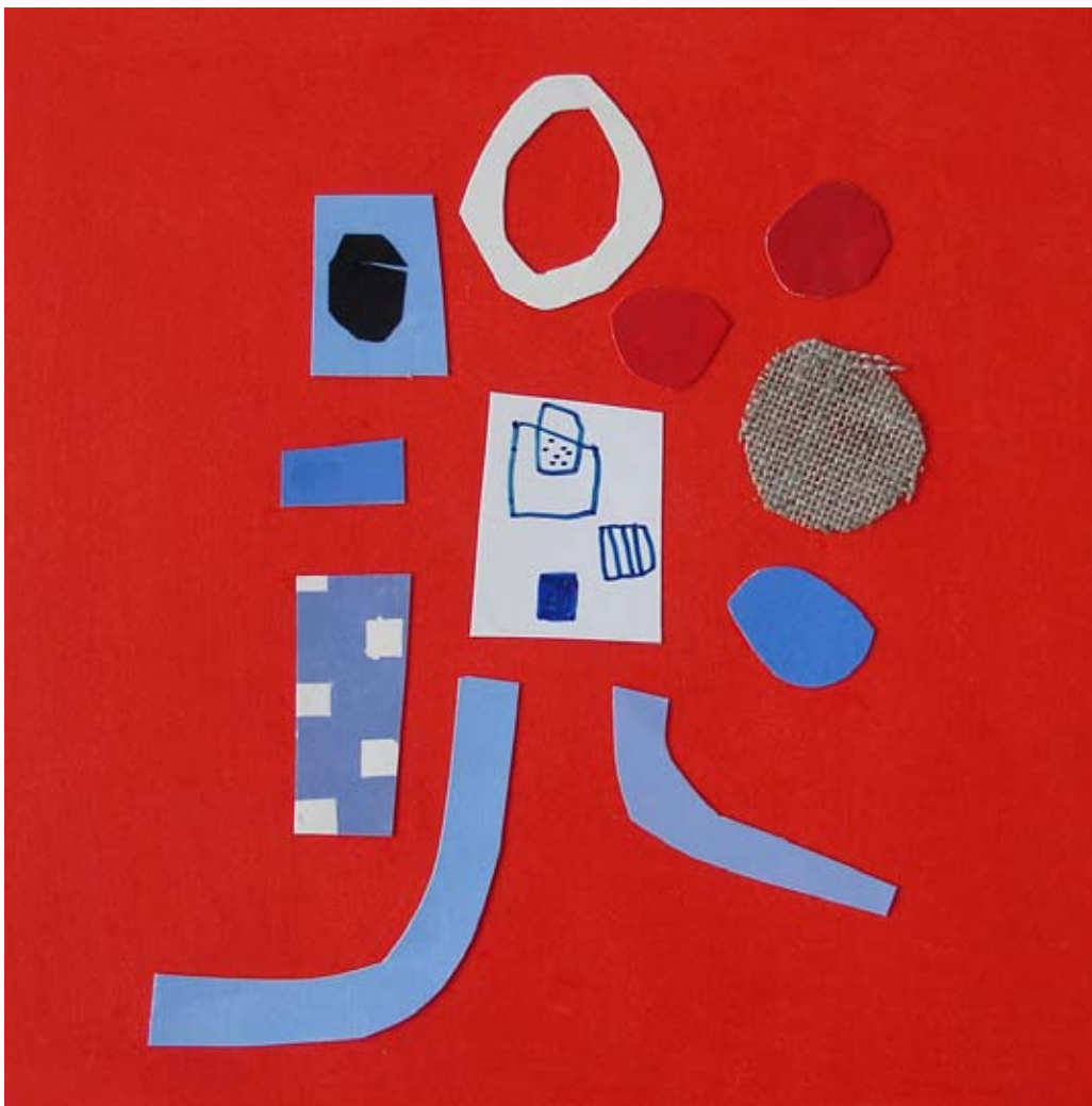
Sally McGill, Imagine Red, 350 x 350 mm (framed), Mixed media

T +44 (0)7721 400 048 E info@bicha.co.uk www.bicha.co.uk