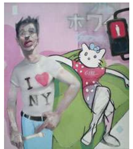
Antony Micallef Ginza Gigolo oil on canvas 1180mm x 1340mm