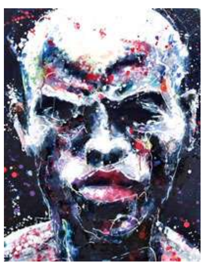
Charles Harrison Reconoistre mixed media on board 810mm x 1010mm