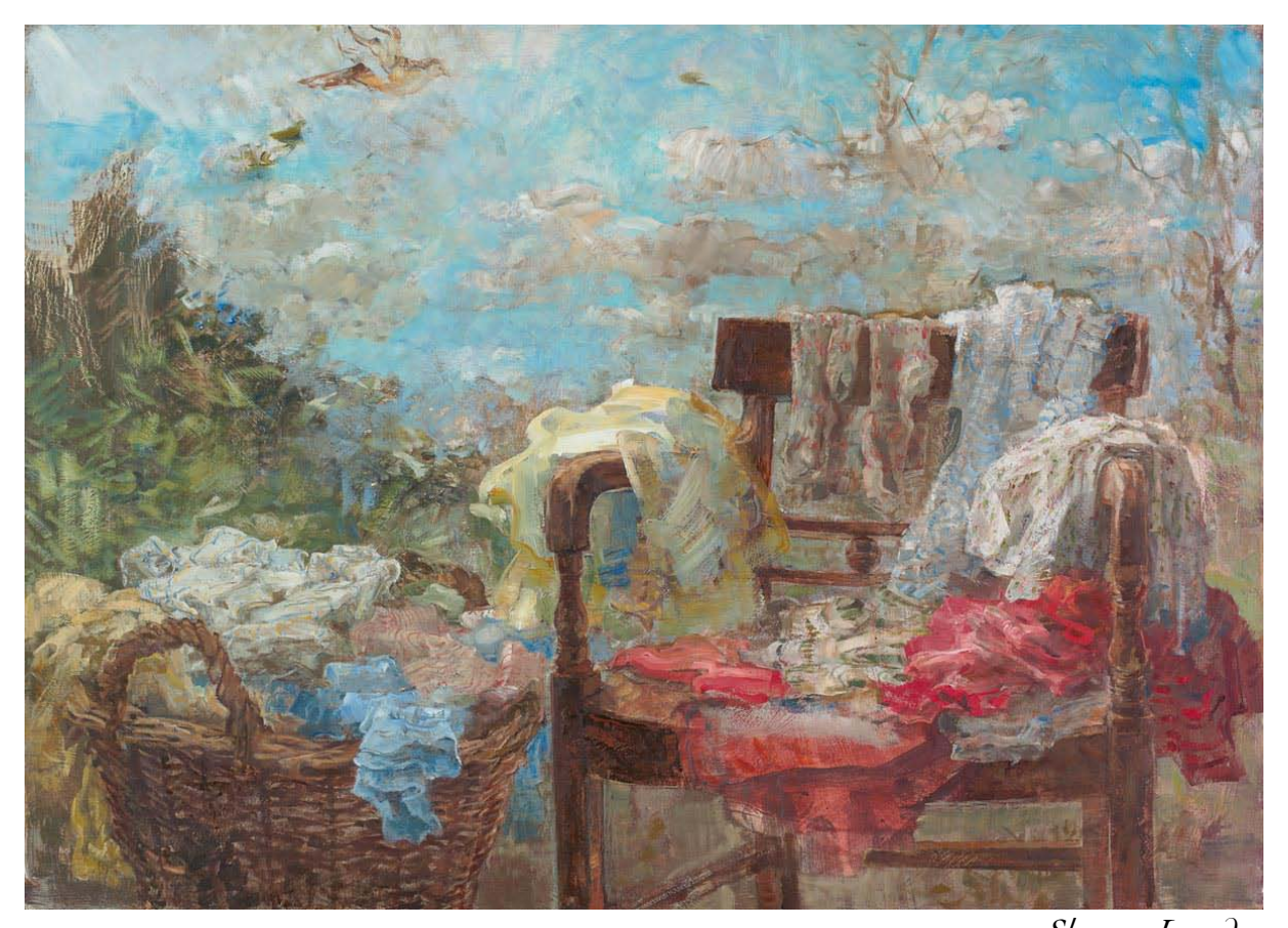
Sky over Laundry

Traditionally, artists are expected to hide themselves away in their studios, I think that this is a mistake. An artist and their family profit from living beside one another. A studio is an inward-looking empty space waiting for the artist to bring it alive, whereas the clutter of a home is an infinitely rich source of subject matter. As a wife and mother, my intention is to make my family and others aware of the romance of everyday life, be it laundry drying, an unfinished breakfast table or the ingredients for supper.