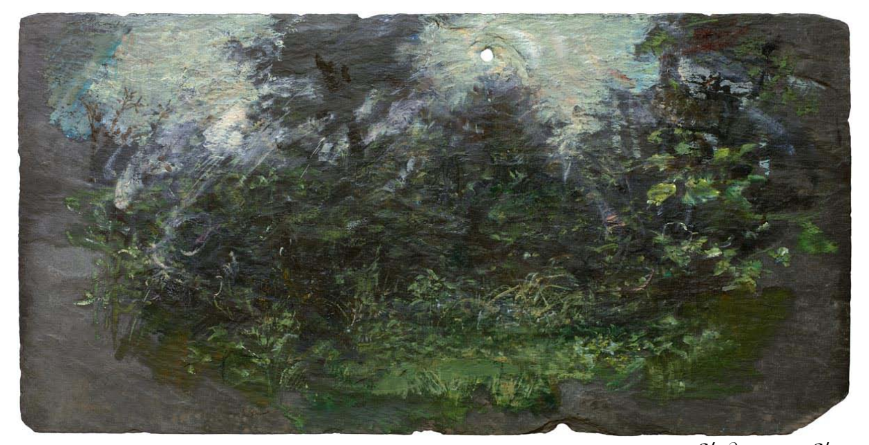
Shadows on a Slate

Her work quietly demands attention through its decisive quality, charm and unusual sincerity. The subjects are traditional but the treatment of them is experimental, painterly, sometimes abstracted and always full of vivid appeal.