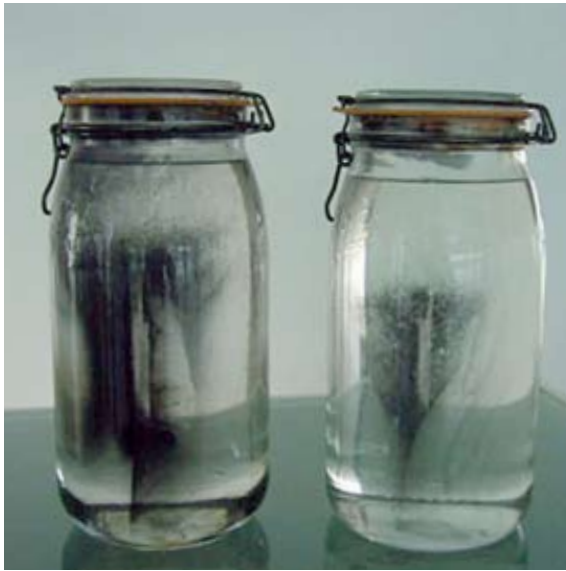
Zoë Schieppati-Emery, Origin of the Species , 2 jars each H 285 x W 135 mm, Monoprint (mixed media, glass jars and liquid light), 2004