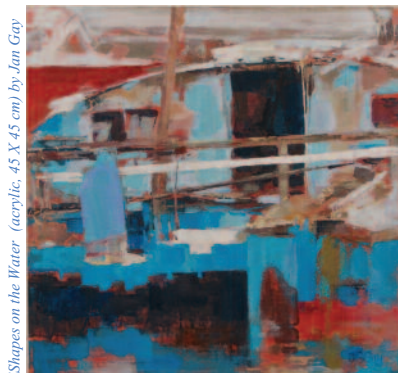
Shapes on the Water (acrylic, 45 X 45 cm) by Jan Gay