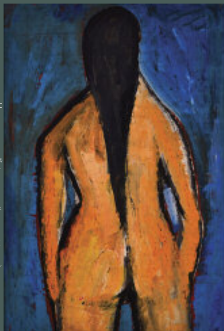
Francis Newton Souza (Indian, 1924-2002), oil on board, signed & dated '56 upper left