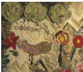
Lynn Stein, 'Cabbages', (detail)

178 West Regent Street, Glasgow, G2 4RL Cyril Gerber Fine Art and Compass Gallery are exhibiting at the Glasgow Art Fair, Mar 25–28, Stand 35. Forthcoming Show: Tom Shanks – New Paintings. Apr 16–May 4. Mon–Sat 10–5.30 compass@gerberfineart.co.uk www.compassgallery.co.uk t 0141 221 6370