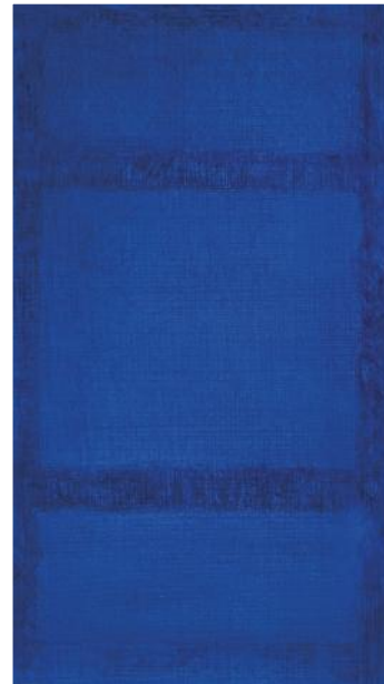
Images from top Untitled IX, Etching (2000), 24" x 29" Untitled IV, Etching (2000), 20" x 35"