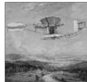
Illustration of a W. Moore-Brabazon aeroplane from 'The Art of Invention' at the Watercolours + Works on Paper Fair (see listing on map 24)

c CREATIVE PICTURE FRAMING 81 Baker Street, London W1U 6RQ Contemporary Paintings and Prints . Professional onsite framing service. Mon-Fri 9.30-6, Sat 10-5 info@creativepictureframing.co.uk www.creativepictureframing.co.uk t 020 7935 7794