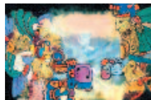
Aubrey Williams. 'Dawn and Evening Star', (Olmec Maya Series), 1984, oil on canvas