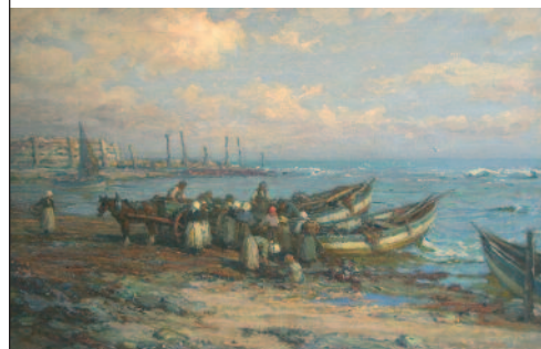
William Pratt, 'Collecting the Catch', oil on canvas, 26¼ x 40½